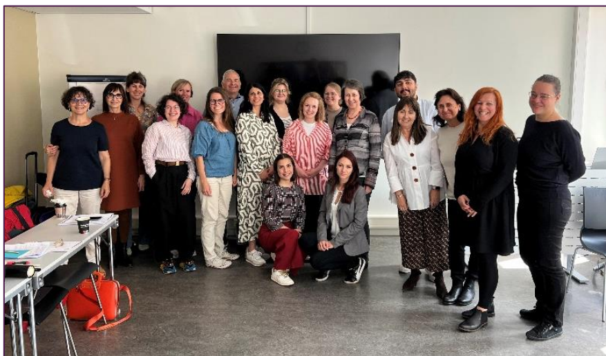
Members of the EQui-T project consortium in Oslo