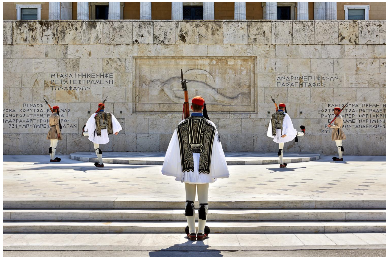
Image 5. "Syntagma" Square – In front of the "Unknown Soldier" monument